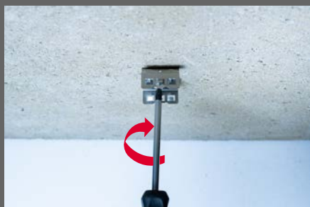
Screw on mounting clamps