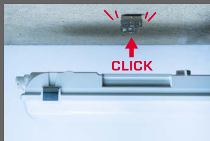
Click in the light fitting